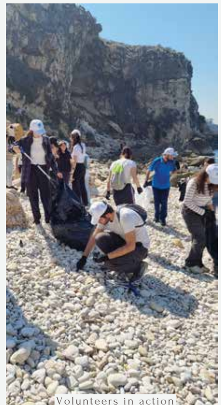
Volunteers in action