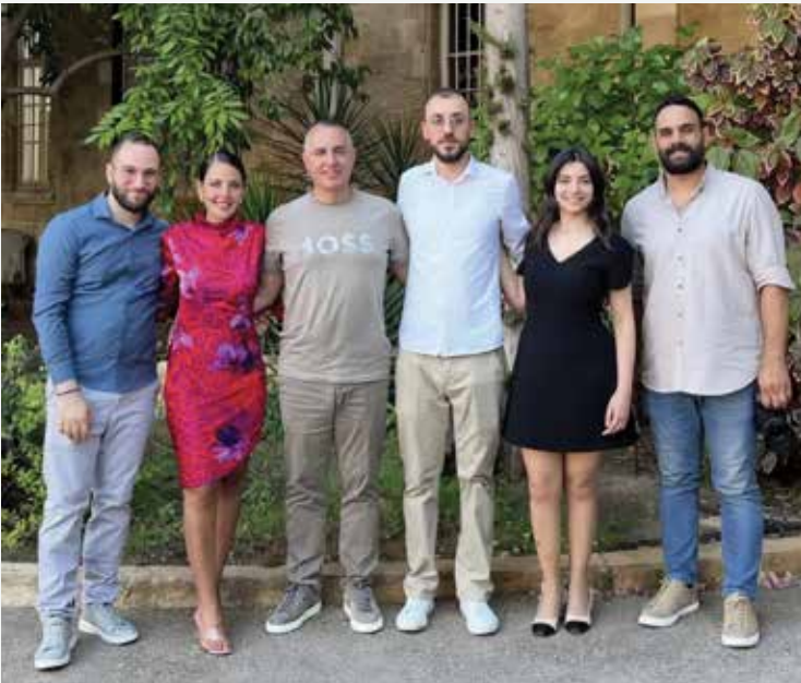
CEEDD's "dream team"