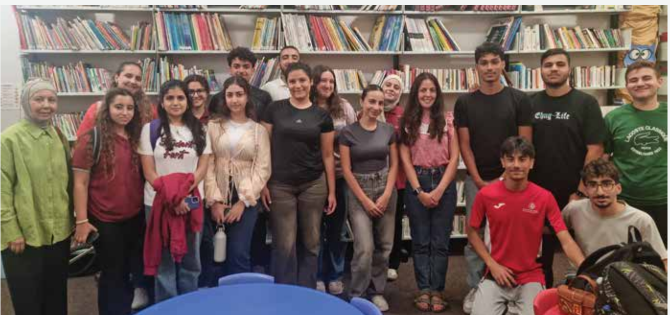
The Last Training Session

The Youth Club’s Gender Equality Project spanned across 3 schools, with students and educators united around the values of respect, equity, and inclusion. The 3 schools were: Lycée Makassed Khadija El-Kobra, Collège Mesrobian des Arméniens Catholiques, et l’Ecole Secondaire des Filles de la Charité. 4 trainers were involved, and around 74 students were targeted.