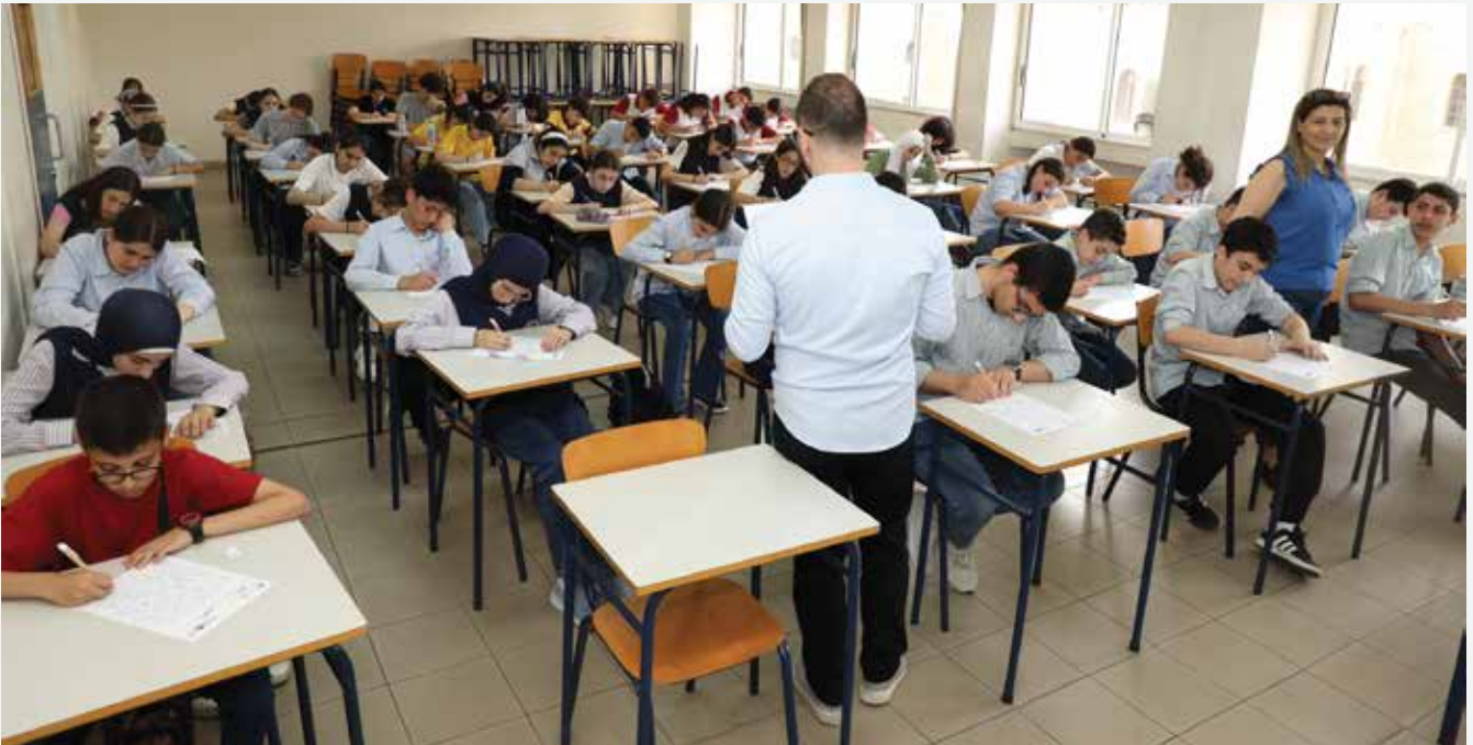
Students in action

Held on the occasion of the International Day of Living Together in Peace, the “Dictée Verte” competition brought together students from various schools and faculties to reflect on the values of coexistence, respect, and environmental awareness, through the French language. The competition celebrated not only linguistic excellence but also eco-citizenship. The initiative culminated in the awarding of prizes to the top three winners, recognizing their attention to detail and their thoughtful engagement with the themes of peace and sustainability. The event fostered a spirit of unity among youth, encouraging both reflection and action for a greener, more inclusive future.