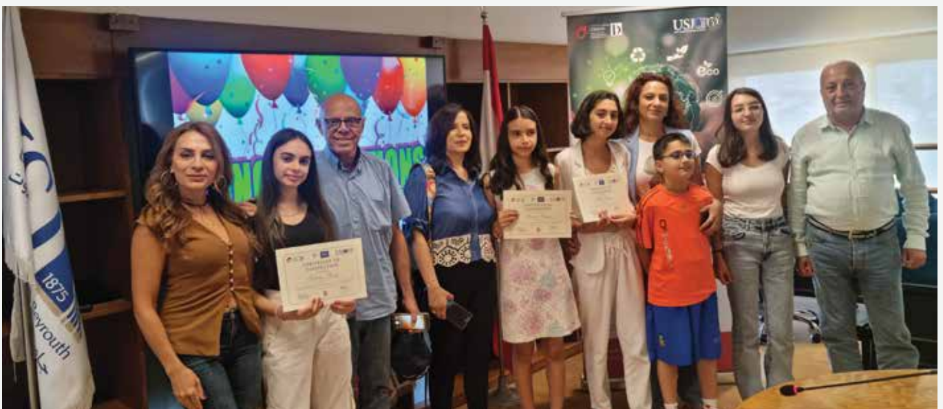
The 3 winners and their families