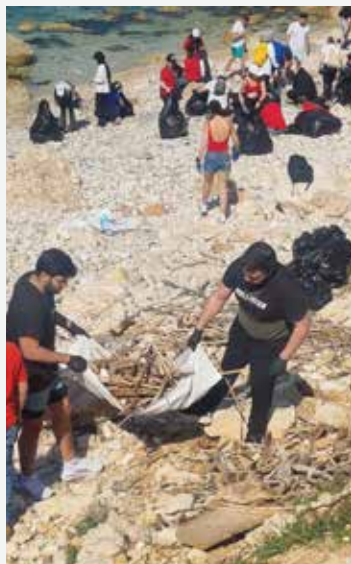
Unusual Waste found