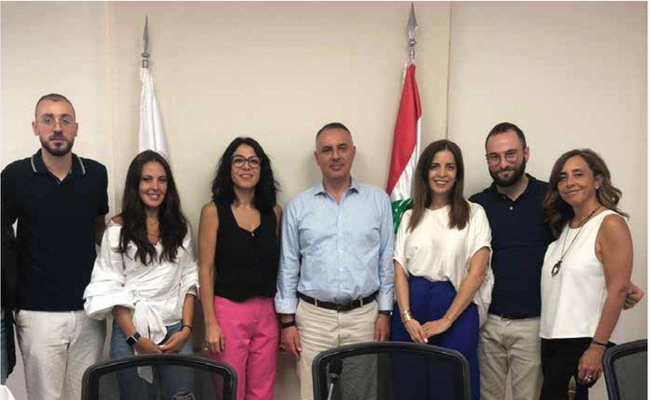
Steering Committee Members

Each year, the steering committee of the Chair meets twice a year. It plays a central role in guiding the strategic direction, vision, and activities of the Chair. Composed of representatives from partner institutions, academic experts, and sustainability practitioners, the committee convenes twice a year to evaluate progress, set priorities, and ensure the relevance and impact of the Chair's initiatives. This year marks the tenth anniversary of the Chair.