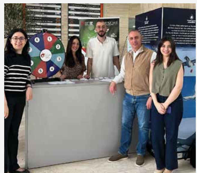
Team & Teamwork

The awareness included a mini knowledge competition, where people could win seeds to be planted if they answered correctly.