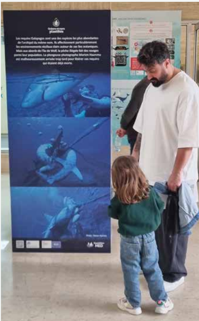
Youth in Awareness vs Awareness in Youth

On the occasion of the “week of the earth”, the Chair of “Fondation Diane”, in partnership with HDF, organized an awareness day on sea pollution, held on the 24 th of April, in the Hospital.