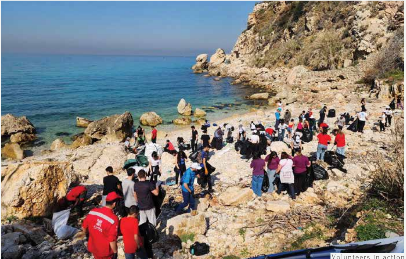
Volunteers in action

For the second year in a row, the CEEDD, in collaboration with O7 and SWIM initiative this year, organized a beach cleaning event, on the shore of Amchit. More than 30 people participated from our side, and a total exceeding 30 bags of waste were collected!