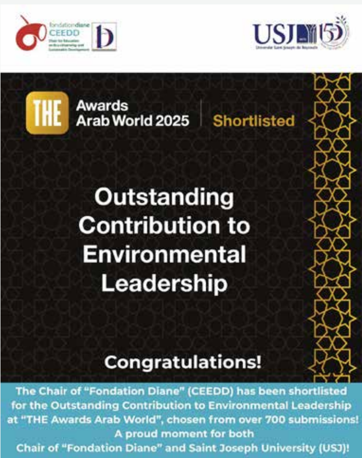
CEEDD's Environmental Leadership

Click on the below platforms icons to access our social media accounts