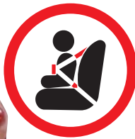
بديع أبو شقرا