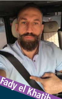
Fady el Khatib

Professional basketball player and one of the best basketball players in Asia history